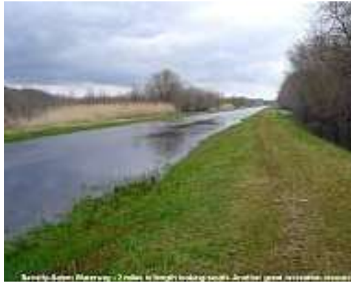
Section of the Beverly-Salem Waterway accessible from the rail trail near Rt. 97