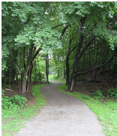
The TLC by the Proctor School

The abandoned rail bed, last used for freight service in the 1950s and passenger service in the late 1970s, runs north-south from Wakefield to Newburyport. In Topsfield it goes from the Wenham town line to the Boxford town line (approximately 4 miles).